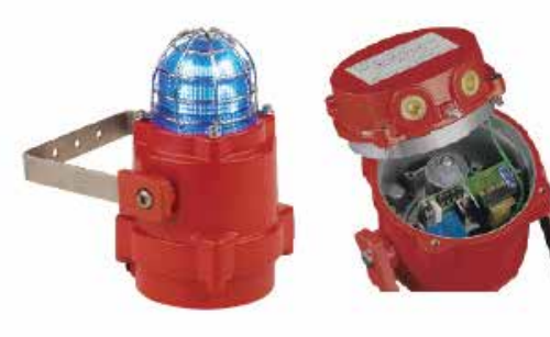
*All candela data is representative of performance with red lens at optimum voltage.